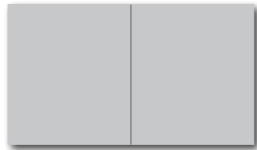
Double Page Spread (2/1) 420 x 260 mm (4 mm bleed)