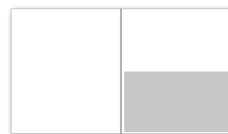
1/2 Page Landscape 190 x 110 mm