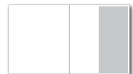
1/2 Page Portrait 85 x 240 mm