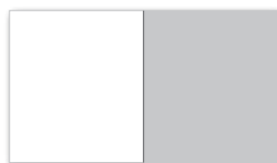
Full Page (1/1) 210 x 260 mm (4 mm bleed)